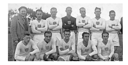
Enjoy the game.

In the end, the ASL initiated a boycott of the USFA's challenge cup. Three teams went against the boycott and were kicked out of the league, but the courts found in their favour. Rancour and disharmony within the sport smashed headlong into the collapsing American economy, and fans decided against spending what little they had watching football. By 1932, amid falling crowds and financial problems, the league eventually folded. But not before it sent a team to the first World Cup, to finish third, still the best finish for a team outside of Europe and South America.